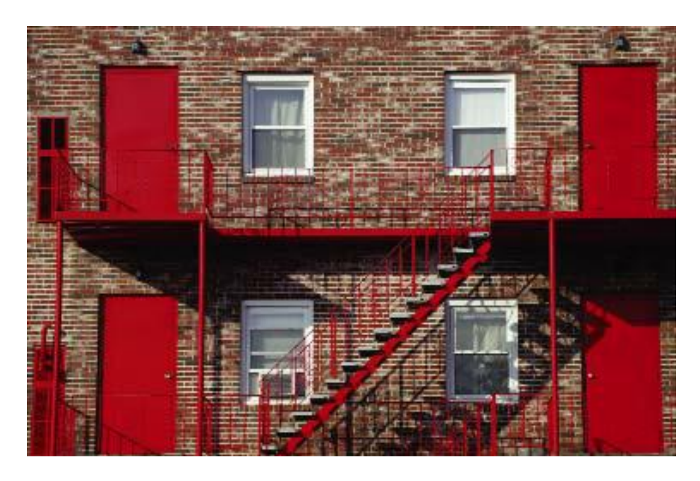
Decide: There are only two, but difficult choices: Follow your plan and immediately leave the building.